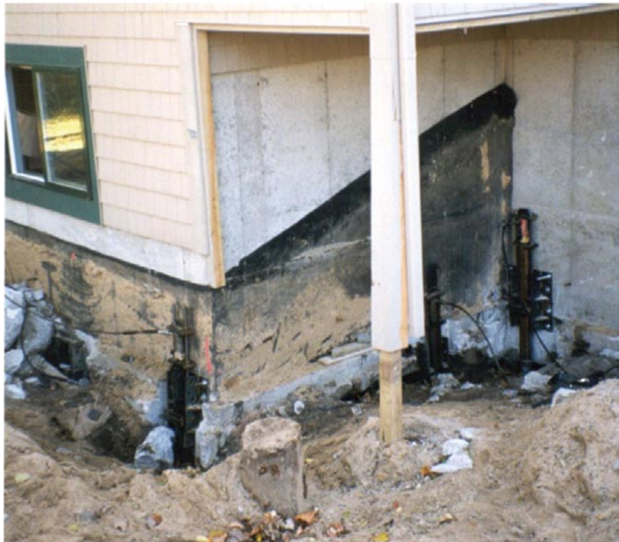
Piers 7, 8, 9 and 10 at the rear of the house near the garage during the lift. Notice the 25-ton hydraulic rams installed on each pier.

The engineer recommended that a sacrificial anode system be installed to protect the pier system. Each pier was electrically connected to a 50 pound magnesium anode. Engineering calculations show that this system will provide a useful life in excess of 50 years!