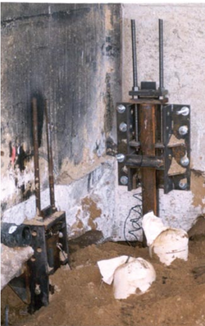
Below, an Atlas Resistance® Standard Continuous Lift Pier and a Continuous Lift Plate Pier are shown fully installed, with the load transferred to the pier and with the magnesium anodes attached.