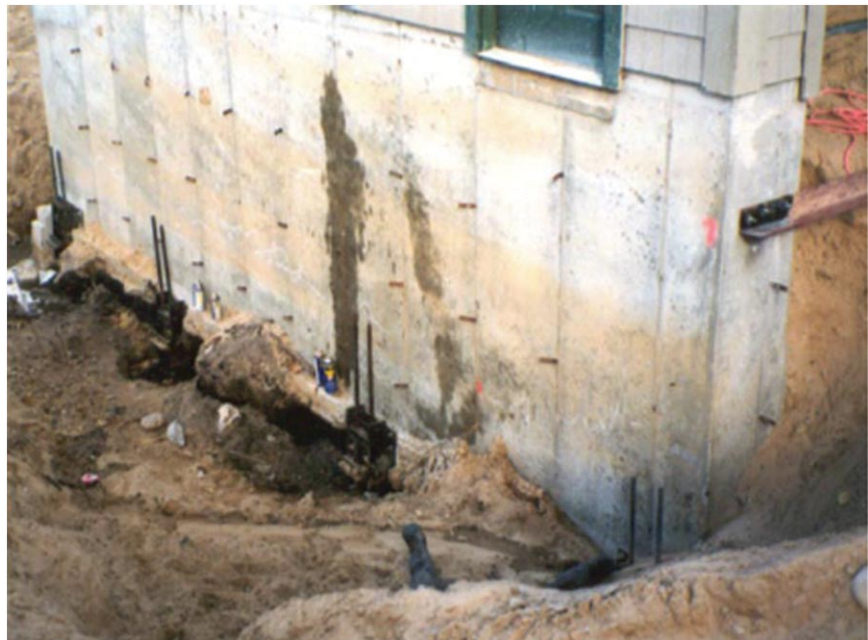
Above, side of the garage showing installed piers No. 1, 2, 3 and 4.