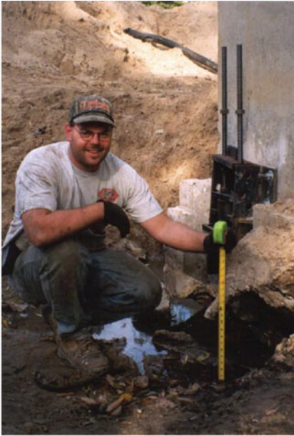
Above, a worker demonstrates the void created when the structure was lifted 13 inches at one of the Atlas Resistance® Continuous Lift Piers.